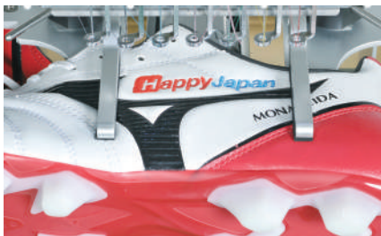
Shoe Clamp Frame (60x100mm)