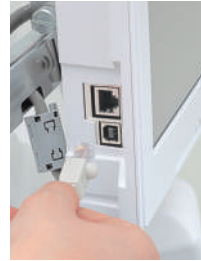
LAN and USB connection