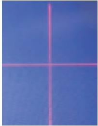
Cross type Laser position marker