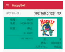
HAPPY BELL Mobile Device Application for machine status notification