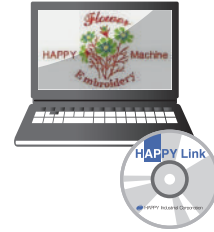
Editing function in HAPPY LAN/LINK software