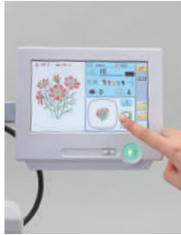
Touch Panel 999 patterns memory 40,000,000 stitches memory