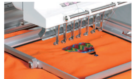
Manual Clamp Frame (Large:150x300mm Small:150x150mm)