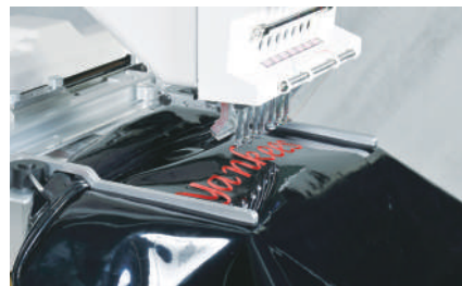
Side Clamp Frame (140x220mm)