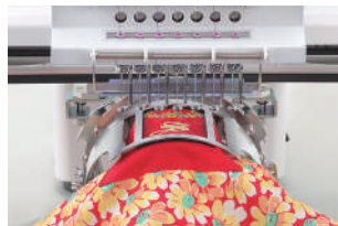
One Point Frames