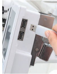
USB and Mouse