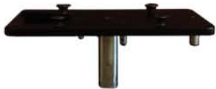
Optional Mounting Kit (Same as Touchdown Platen, Optional Purchase as well)