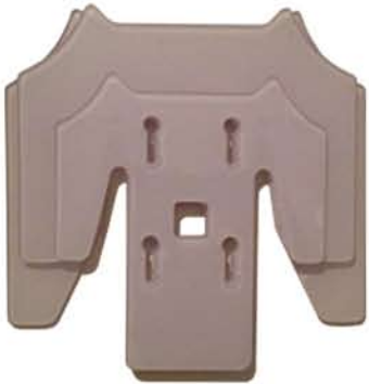
Three Shoe Platen Inserts